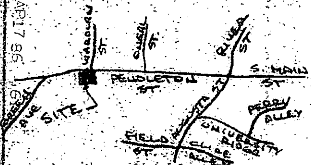
LOCATION MAP NO SCALE

I Certify That The Ratio Of Precision Of The Field Survey Is 1/10,000 As Shown Hereon And That The Area Determined By D.M.D. Method Of Area Calculations.